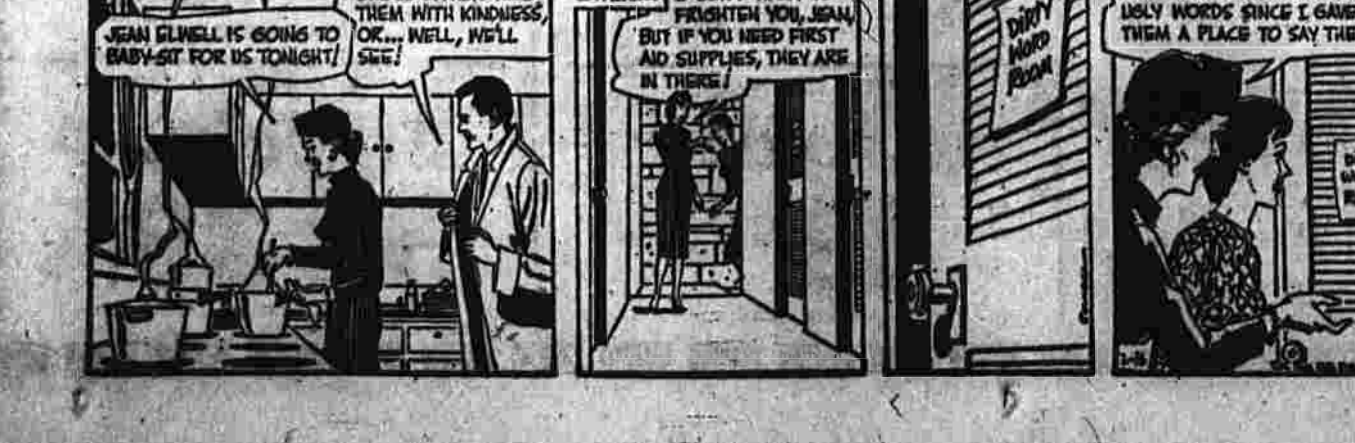
THE STORY OF MARTHA WAYNE